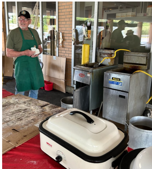
VVA Ch. 237 members working their fish fry magic!