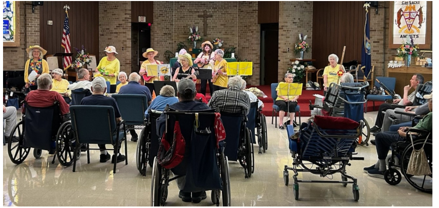
The Sunshine Girls are always a hit when they entertain!