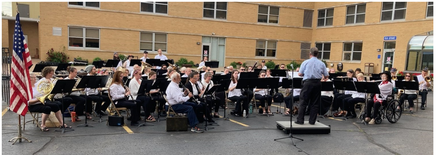
BOTTOM: Marquette City Band performed a very special patriotic concert onsite for the 4th of July