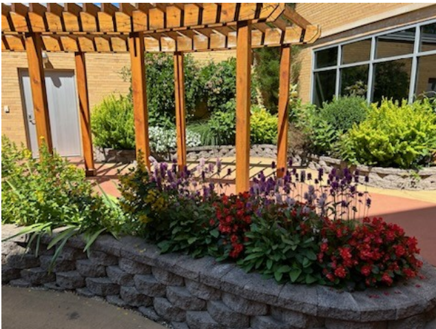
LEFT: Photo of our BEAUTIFUL Ground Floor Garden