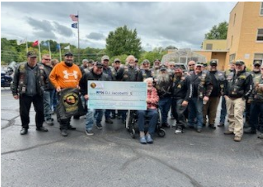
Since 2014, CVMA 35-1 has donated $67,101. This year, they committed to a $10,000 donation bringing the 10-year total to a WHOPPING $77,101.