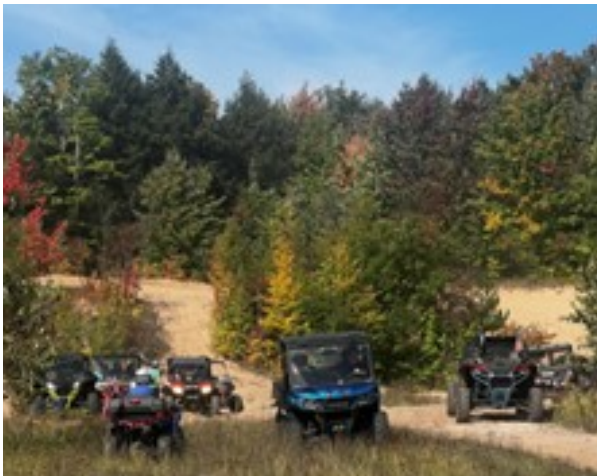
Hiawathaland Snowmobile Club hosted our members for side by side rides and lunch! The day was perfection!