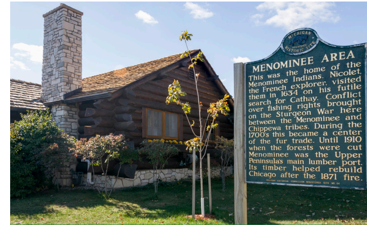
Menominee Welcome Center