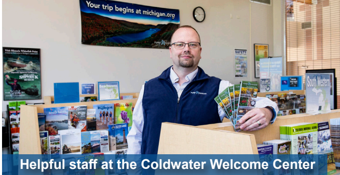
Helpful staff at the Coldwater Welcome Center