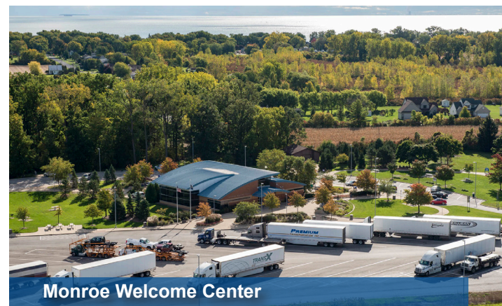
Monroe Welcome Center

For additional details, visit: www.Michigan.gov/WelcomeCenters