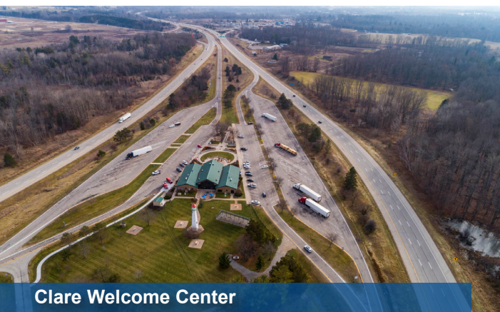
Clare Welcome Center

Whether you are from another state or right here in Michigan, MDOT wants to ensure your travel through Michigan is informative, welcoming, and fun!