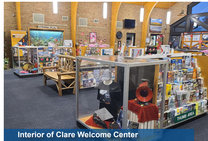
Interior of Clare Welcome Center

A vendor wishing to distribute literature through MDOT's Welcome Center literature program must submit a copy to the statewide literature coordinator for approval. Once approved, the vendor will receive a commodity code and instructions for sending their literature to the MDOT Warehouse in Lansing or directly to each Welcome Center.