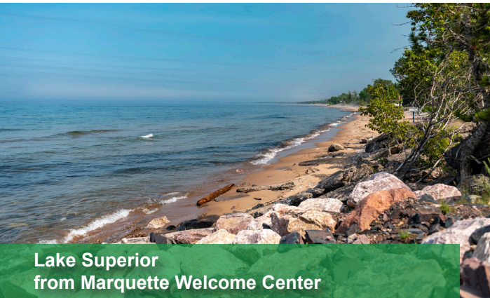
Lake Superior from Marquette Welcome Center

When traveling, don't forget to stop at any of the friendly Welcome Centers in Michigan for travel tips and ideas from our welcoming staff, as well as modern rest areas for a quick break to stretch your legs and enjoy a scenic view or even a picnic. MDOT's travel counselors are here to help guide you on your journey.