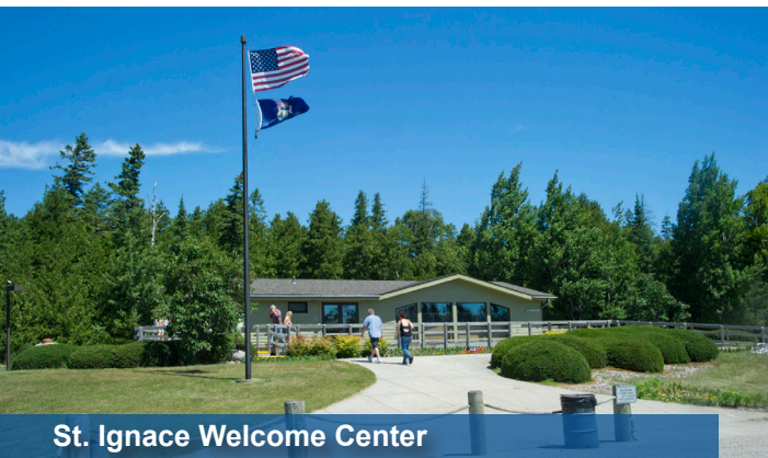
St. Ignace Welcome Center

Every year, millions of people visit the Great Lakes State. Michigan's 14 Welcome Centers see more than 5 million visitors combined annually. Most tourists are in search of a variety of activities, including water recreation, scenery, camping, culinary experiences, vineyards, historic attractions, fun festivals, and so much more.