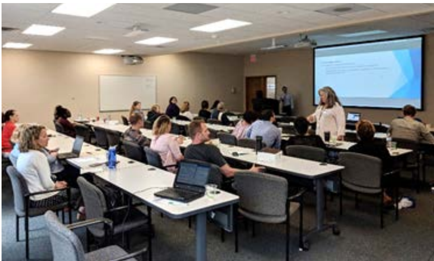
Pictured: Stakeholders convene at the Michigan Public Health Institute in Okemos for the 2018 Viral Hepatitis Stakeholder Forum

For those who were unable to attend, meeting handouts, PowerPoint slides, and a recording of the event are available here and through www.mi.gov/hepatitis . If you are interested in attending the 2019 Viral Hepatitis Stakeholder Forum, please forward your name and e-mail address to MDHHS-Hepatitis@michigan.gov to be added to the invitation list. We hope you can join us next year!