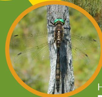
Hine's Emerald Dragonfly