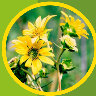
Rosinweed ( Silphium integrifolium )