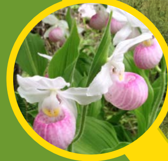
Showy Lady's Slipper