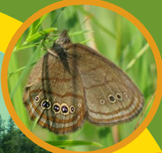
Mitchell's Satyr Butterfly