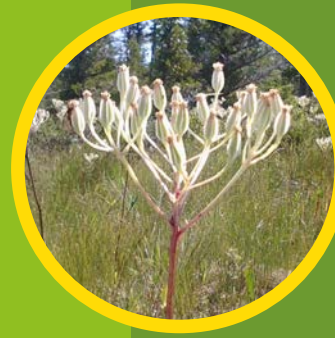
Prairie Indian-plantain ( Arnoglossum plantagineum )