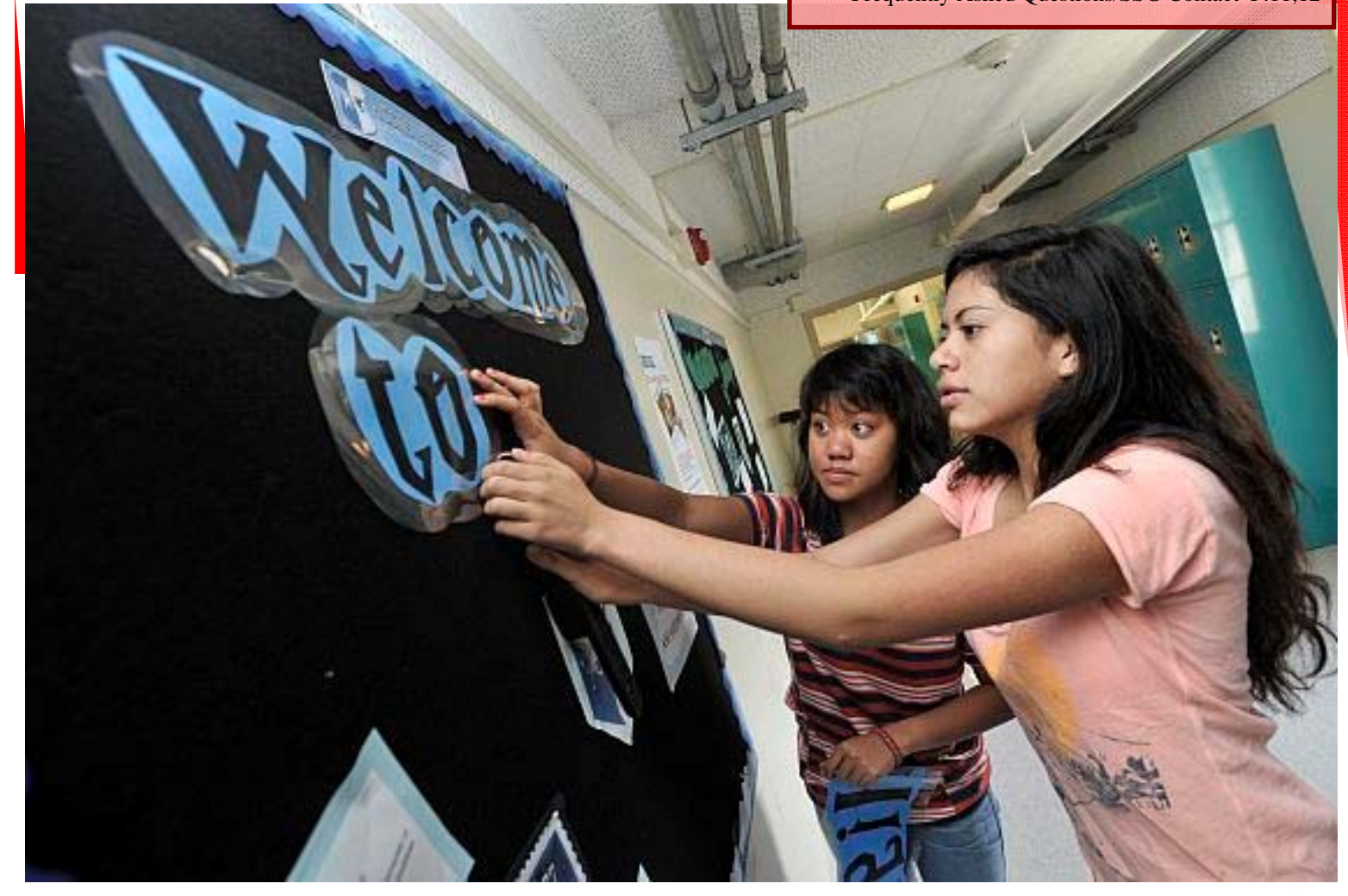
It's that time of year again . . . back to school time!

High School Counselor Webcast P.2 TIP Myths and Facts P.3 High School Counselor Webinar/Postsecondary Handbook P.4 Outreach Activities P.5 Additional Resources P.6 TIP Lookups and MSFAA Corner P.7,8 New Requirements for Student Aid Programs P. 9 High School Highlights and Calendar of Events P. 10 Frequently Asked Questions/SSG Contact P.11,12