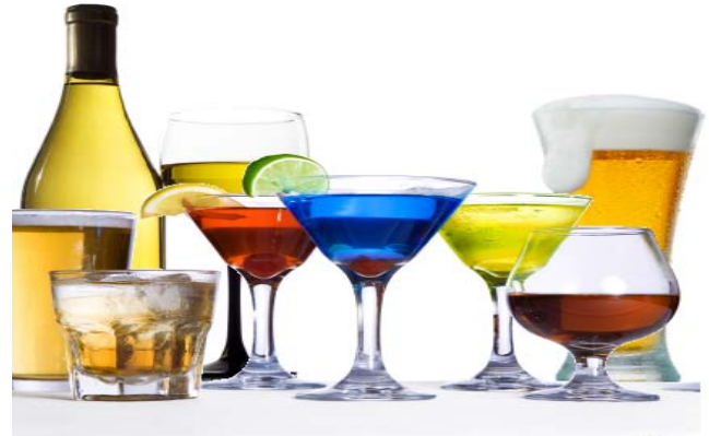
Perception of Weight and Drinking

“Nondrinkers” reported not drinking any alcohol in the past 30 days. “Current drinkers” reported having at least one drink of alcohol in the past 30 days. “Youth” are 9th-12th grade students attending Michigan public high schools. **BMI” is a measure of body fat based on weight & height, for more information, visit: http://cdc.gov/healthyweight/assessing/index.html