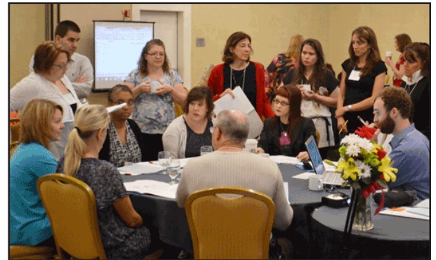
Teachers participate in the latest formal review of the Dynamic Learning Map in June 2012. More than 170 teachers have been involved in developing and refining the map since the DLM project began.

Items will be built on models of effective classroom instruction