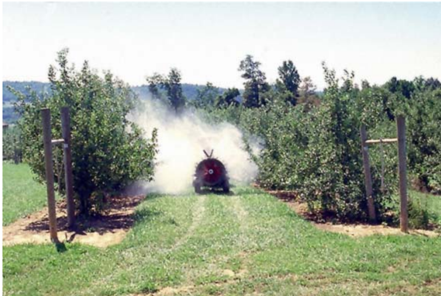
An airblast sprayer spraying in an orchard.

Carbaryl is a carbamate that is classified as a general use pesticide, but formulations vary widely in toxicity. An example is Sevin®. Aldicarb is a restricted use carbamate and is an extremely toxic systemic insecticide that is applied directly to the soil. An example is Temik®.