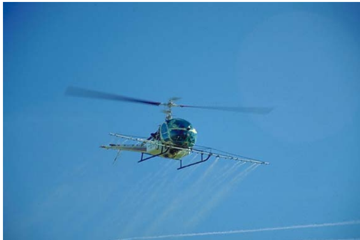
A Hiller helicopter in flight using a boom sprayer.

MDA regulates the applicator pilot, the aircraft spray system, and the aerial application company when pesticides are applied by air. The Federal Aviation Administration (FAA) oversees the pilot and the aircraft. Complaints regarding the aircraft and actions of the pilot should go to the appropriate district office of FAA (Detroit, Grand Rapids, or South Bend). Complaints regarding spray drift incidents should go to MDA.