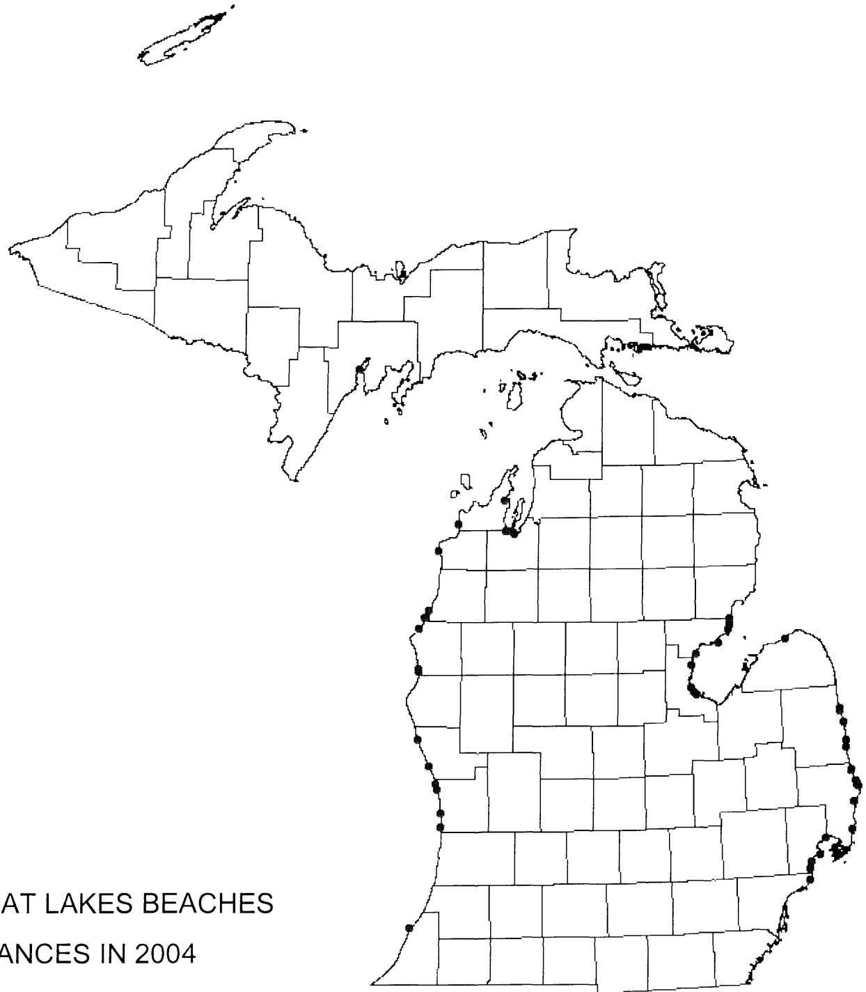
FIGURE 3: MICHIGAN GREAT LAKES BEACHES WITH WQS EXCEEDANCES IN 2004