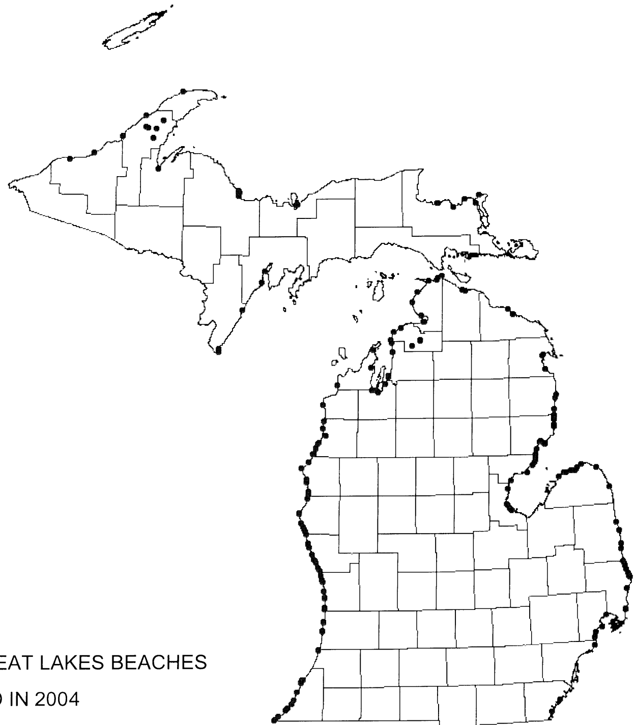
FIGURE 2: MICHIGAN GREAT LAKES BEACHES MONITORED IN 2004