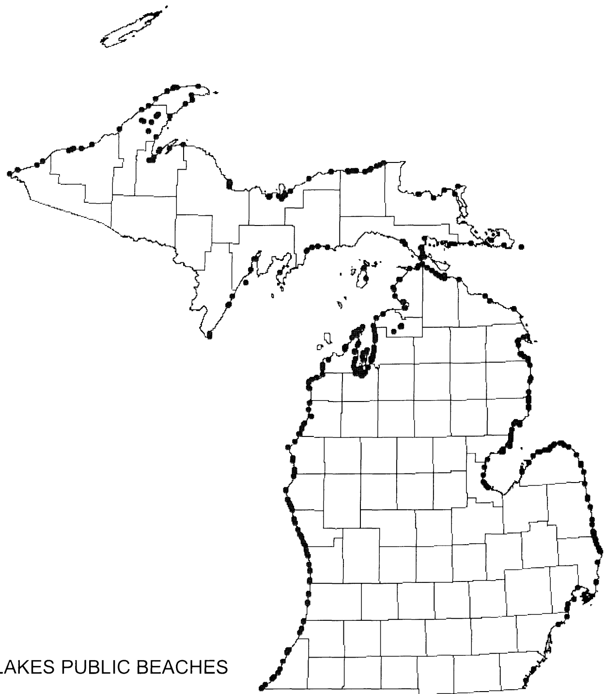
FIGURE 1: MICHIGAN GREAT LAKES PUBLIC BEACHES