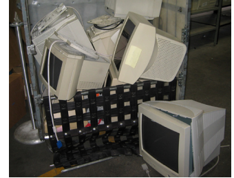
State of Michigan Surplus Computer Equipment

Computers and televisions are the most visible products in the electronic waste stream that also includes cell phones, DVD players and more electronic products yet to be designed. The Pollution Prevention program in DEQ has been providing information to generators and communities for over 10 years to assist them in safely recycling and reusing this growing part of the state's hazardous and solid waste streams. DEQ has: