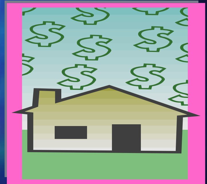
STRATEGIC WATER QUALITY INITIATIVES FUND